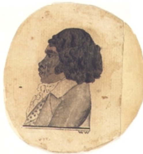
Figure 1. An undated portrait, believed to be of Bennelong (Barani 2003)

Traditionally, Otherness has been of instrumental value vis-à-vis novelty . It might be a curio or a showpiece of something acquired out of interest or through travel or conquest. For example, just as platypuses and echidnas were sent back to England to show what a strange and exotic place the new outpost was 6 , so too was Bennelong, a member of the Wangal people, sent by Governor Phillip to England in 1793 to be presented to King George III (Barani 2003). Not as a traditional native, but gentrified in English apparel and speaking English, as depicted in Figure 1. A black man made white through having been civilised; an experiment in “softening, enlightening and refining a barbarian” (Barani 2003). Otherness contained, controlled and sanitised. An adornment of the powerful. A piece of the collection, which demonstrated the reach and control of, in this case, Britannia. Bennelong would have been aware of his marginality, “by the nature of the ‘English eye’, the all-encompassing ‘English eye’ ... strongly centred; knowing where it is, what it is, it places everything else” (Hall 1997, pp.20-21).